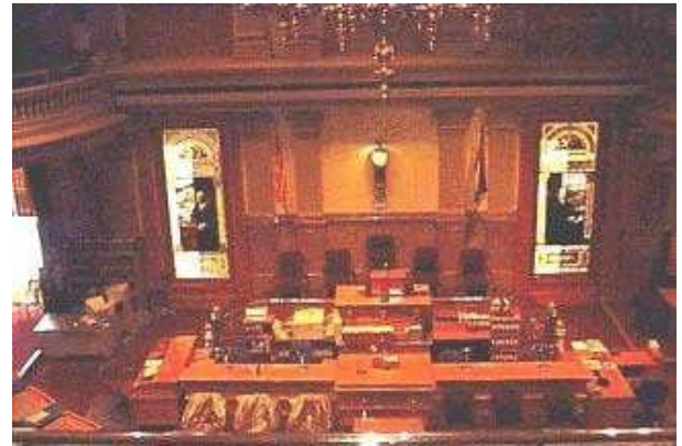
Colorado Senate Chambers