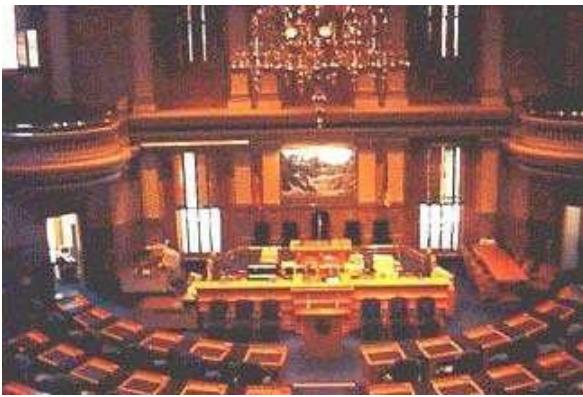
Colorado House Chambers

(A review of the Colorado State Laws affecting High School Activities Participation)