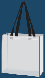
CLEAR PLASTIC BAG 12" X 12" X 6"