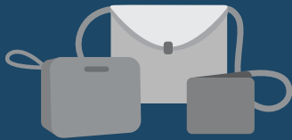
CLUTCH PURSE 4.5" X 6.5" OR WALLET 3" X 4"